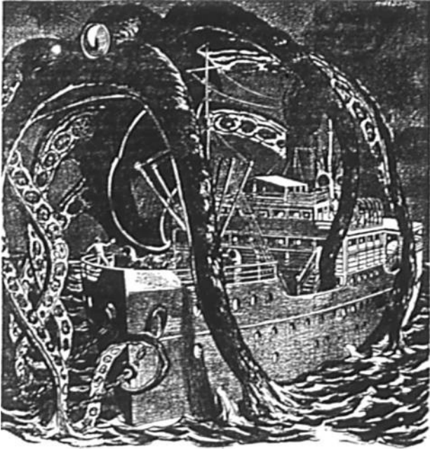
“The mass hung over the ship.”

“BEG your pardon, sir. I’m looking for Dr. Bird.”